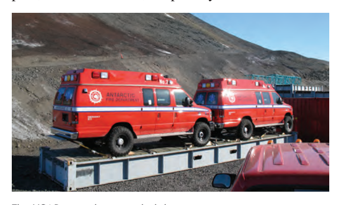
The USAP recently upgraded the emergency response equipment at McMurdo Station.

NSF is currently in the process of updating the master plans for both McMurdo and Palmer Stations. For McMurdo, the Master Plan is in the final stages of development. The Master Plan addresses most of the large-scale investments recommended by the Panel for operational efficiency and safety. For example, it seeks to minimize the need to handle materials multiple times, to improve energy efficiency and to consolidate functions to reduce personnel requirements. Activities are being sequenced in discrete phases to ensure continuity of operations as upgrades proceed. A Palmer Station Systems Study was released in 2010. This study considered some of the health and usability issues that were raised by the BRP. In accordance with the BRP's recommendation, an in-depth study of the fire suppression systems at all USAP operating locations will be undertaken in FY 2014. In the near-term, NSF has continued to take steps to ensure that fire protection systems are fully operational in critical facilities in Antarctica such as berthing and food preparation areas. NSF will consider the results of these studies and update its long-range investment plan, discussed below, for priority investments.