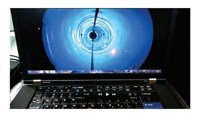
An image from the Whillans Ice Stream Subglacial Access Research Drilling project (WISSARD) borehole camera. In January 2013, scientists and drillers with this interdisciplinary project announced that they had sucessfully used a first-of-its-kind, biologically-clean hot-water drill to directly obtain samples from the waters and sediments of subglacial Lake Whillans.

NSF will expand pre-deployment testing and evaluation activities now used for larger and more complex projects. For example, both the deep ice core drill and the CReSIS (Center for Remote Sensing of Ice Sheets) radar technologies were tested extensively in Greenland before being deployed in Antarctica. NSF has also strengthened requirements for field instrumentation proposals to achieve two principal objectives that tie directly to recommendations of the NRC and BRP reports. First, proposal solicitation language now requires that instrumentation be developed with holistic considerations of simplicity and reliability of deployment, service, and operational support in addition to achieving the scientific requirements for particular observations. This is intended to minimize the operational footprint and thus contain costs associated with deployment, servicing, and retrieval of scientific instrumentation. Second, solicitation language requires instrument development proposals to employ and explicitly describe project management best practices, such as defining milestones for development and testing, establishing criteria for evaluating whether or not milestones are met, and conducting readiness reviews prior to deployment. These changes