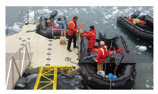
A new floating dock and ramp system at Palmer Station provides improved safety and efficiency for conducting small boating operations in support of marine research.

Specific to boating operations at Palmer Station, NSF has taken actions to improve the safety and efficiency of boating operations at Palmer Station. NSF is working on assessments in preparation for replacing the pier and mitigating a hazardous underwater rock ledge that currently limits the size of vessels that can directly access the station. An improved pier is expected to take two years to complete once funding has been identified. In the meantime, a temporary fender system is being employed to keep docked ships away from the underwater obstruction. Safety concerns related to small boat embarkation/disembarkation have been resolved through installation of a floating dock at Palmer Station. The Antarctic Support Contractor is working with vendors to finalize requirements for RIBs (rigid-hull inflatable boats) that are expected to be delivered and operational in FY 2014 to safely extend science operations farther from the station than is currently possible. A boat ramp to facilitate safe launch and recovery of all small craft has been designed and is scheduled to be constructed and operational in this same timeframe.