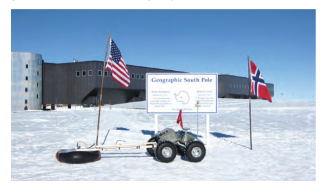
The Yeti robot (pictured in the foreground) was used successfully last season to remotely locate sub-surface areas with buried structures or voids so that the overlying snow could be made safe for surface activities.