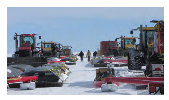
Long-distance, over-snow, heavy-haul traverse trains provide an efficient alternative to airlift for moving cargo, fuel, and science equipment to remote sites.

Funding for implementation will be included in a future budget request. Once funded it will take