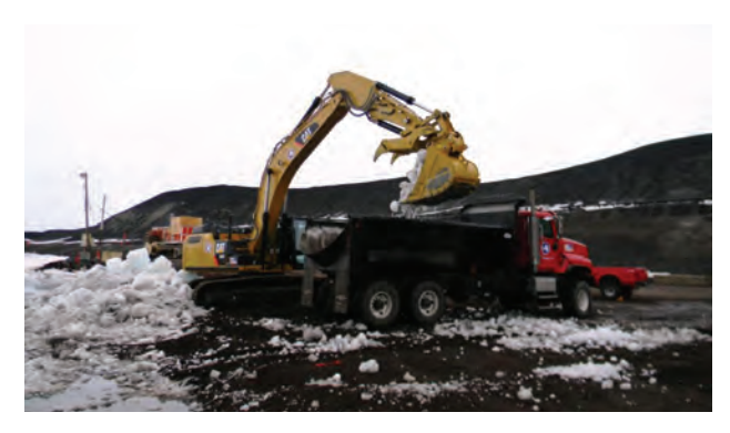
The USAP recently introduced more versatile dump trucks at McMurdo Station. These multi-purpose, commercial trucks have beds that can be converted for varied uses such as for towing, cargo movement, and hauling bulk materials. This reduces the types and numbers of vehicles required and capitalizes on the savings to be gained from standardization.

Due to the inclusion of procurement- and budgetsensitive elements, distribution of the LRIP is limited to a management group with direct responsibility for implementation and oversight of the USAP.