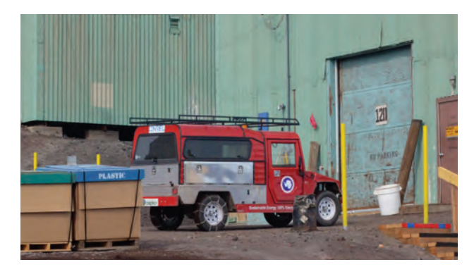
NSF partners with the Department of Energy to identify opportunities to expand the USAP's use of alternative and renewable energy, such as the electric vehicles that are now in use at McMurdo Station.

to determine the feasibility and advisability of expanding the use of wind turbines in McMurdo. In addition, significant returns to both the USAP and AntNZ are thought to be achievable by optimizing operation of the current system. At no cost to NSF, the New Zealand program supplied engineering and technical personnel to review and optimize the existing power production and distribution systems on Ross Island. The overall goal is to modernize the infrastructure and reduce overall power demand so that the majority of power can be provided from the existing one-megawatt wind turbine system.