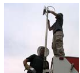
HPWREN investigators mount

In addition to linking up academic institutions ranging from elementary