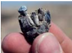
Portion of child's jawbone of Ardipithecus, a recently discovered ancestor of humans.

In March, NSF announced a $1.5 million Innovation Award to the QoLT Center to help start-up companies affiliated with the center move these new technologies to the marketplace. The new advances will help millions of Americans continue to be productive and successful members of society.