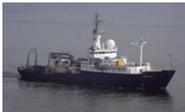
The research vessel Melville undertakes a rapid response mission to Chile.

NSF-funded scientists aboard the research vessel Melville are undertaking an expedition to explore the rupture site of the recent 8.8-magnitude earthquake off the coast of Chile. The rapid response expedition is possible because the Melville had been conducting research in the Chilean coastal area when the earthquake struck.