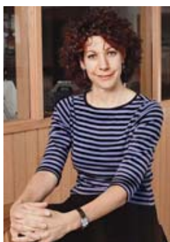
Bonnie Bassler.

Bonnie Bassler, NSF-funded investigator at Princeton University, is fascinated by the social lives of bacteria. She has discovered that bacteria communicate using a chemical language. Her realization, that these tiny organisms form a social network and communicate with each other using a process called quorum sensing, has transformed the way biologists think about bacteria and may one day lead to new types of antibiotics.