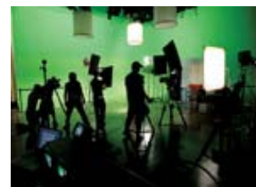
USC production area.