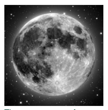
The moon as seen from Kitt Peak in Arizona.

High-energy particles called cosmic rays are rattling around our galaxy all the time. Those that reach the earth cause sprays of secondary particles when colliding with the upper atmosphere. Particle detectors studying rare phenomena such as neutrinos (subatomic particles) are often placed deep underground, where the rock shields out the