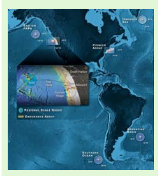
Geographic locations of OOI components.

The Consortium for Ocean Leadership and NSF have signed a new cooperative agreement to begin construction and initial operation of a vast network of undersea sensors. The project, known as the Ocean Observatories Initiative, OOI, will deploy sensors throughout oceans to gather a variety of data on such phenomena circulation patterns, as