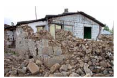
Earthquake damage in Turkey, 2003.

Experts say that Haiti's recent earthquake was anything but a "natural" disaster. While the root cause was a geological event, a magnitude 7.0 earthquake, this natural occurrence would not have produced the near-catastrophic results it has, according to several NSF-funded researchers, were it not for Haiti's enormous social and economic problems, including a lack of modern building standards and practices.