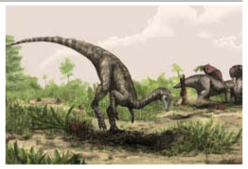
An artist's conception of Nyasasaurus parringtoni.