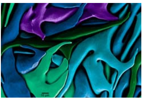
These fantastical structures are the microscopic crystals that make up a sea urchin's tooth.

Some of science and engineering's most powerful statements are not made by words alone. Illustrations can help explain, explore and encourage interest in systems and phenomena ranging from cell composition to chemical catalysts to computational modeling. For 10 years, NSF and the journal Science have co-sponsored the annual International Science & Engineering Visualization Challenge to recognize superb examples of the visual communication of science for educational and journalistic purposes. Winners were recently announced in five categories: Photography, Illustration, Posters and Graphics, Games and Apps, and Video. The winning entries are featured in the February 1 issue of Science and on the Challenge website.