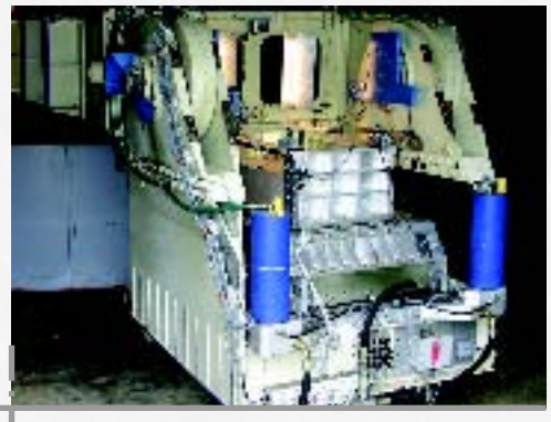
This photo shows the shake table component of the geotechnical centrifuge built by the University of California, Davis. This equipment will help researchers more accurately assess the safety and seismic performance of buildings, bridges, ports, dams, and other elements of the Nation's civil infrastructure.

Teams and individuals can take part in NEES activities onsite or at remote locations and participate in different kinds of research—from individual and small-group studies to "grand challenge" projects in which teams from different