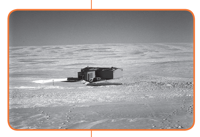
The EPCO building at Resolute Bay Observatory is located at Cornwallis Island in the Canadian Arctic.

WGBH believes that it had NSF's consent in claiming the $775,939 of future costs and therefore disagreed with these questioned costs. However, it reported instituting procedures for annual reviews of service center charges and hiring a new accounting manager to better ensure future compliance with grant requirements.