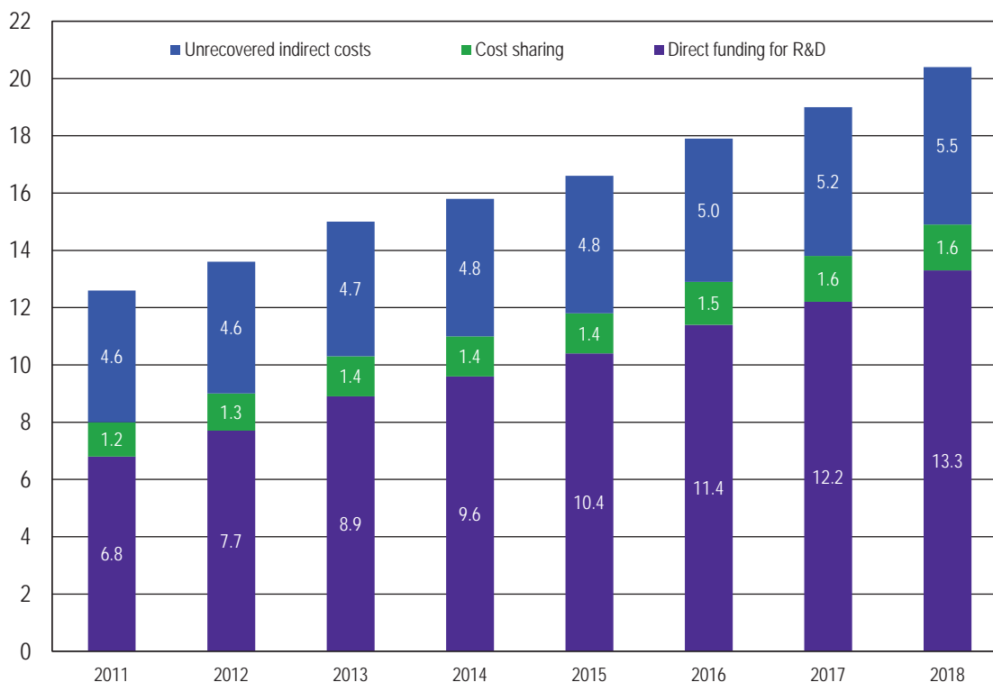
FIGURE 2. Institutionally funded R&D expenditures, by source: FYs 2011–18 Billions of current dollars

NOTE: Includes all institutions surveyed in the fiscal years shown.